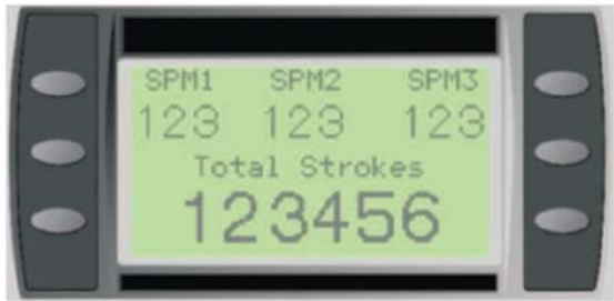
PSC 1/2/3 Showing Total Strokes