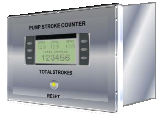
Stand Alone Pump Stroke Counter

Standard cable length of 150 ft. with connectors included (additional lengths available upon request)